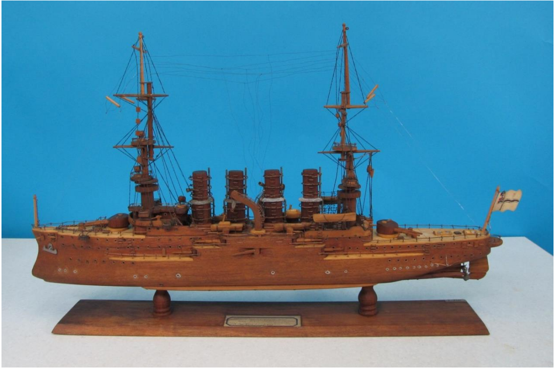
© Davina Kuh Jakobi 2014 Images may not be reproduced.